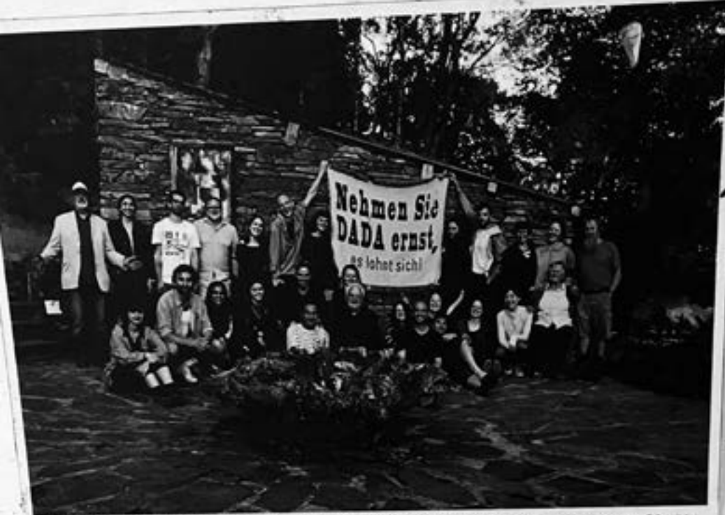
"Nehmen Sie Dada Ernst!" - the triumph of creativity over evil! 70 years later Royal College of Art MA students at the Karl Schwitters Summer School 'reconstructed' the missing Heartfield painting and, on the 70th anniversary of the Munich Entartete Kunst exhibition, hung the Heartfield painting the right way up on the end wall of the Platt Barn.