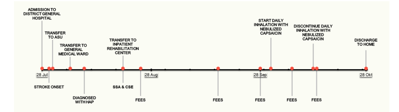
Figure 1. Timeline of the patient's episode of care. ASU, Acute Stroke Unit; CSE, Clinical Swallowing Evaluation; FEES, Fiberoptic Endoscopic Evaluation of Swallowing; HAP, Hospital Acquired Pneumonia; SSA, Standardized Swallowing Assessment.

In his initial presentation, the patient had been admitted to a District General Hospital for investigation of cardiac complaints in July of 2021. Two days later, he had developed new weakness of the left side of the body and speech disorder. He was diagnosed with an ischemic insult of the media flow area of the right cerebral hemisphere. Due to a reduced level of alertness, the patient was transferred to the Acute Stroke Unit (ASU) of the University Hospital for monitoring and consideration of a craniectomy. He received multidisciplinary acute stroke management without craniectomy and with temporary oral and intravenous anticoagulation therapy. Thrombolysis was not carried out. No history of pneumonia was reported from the ASU.