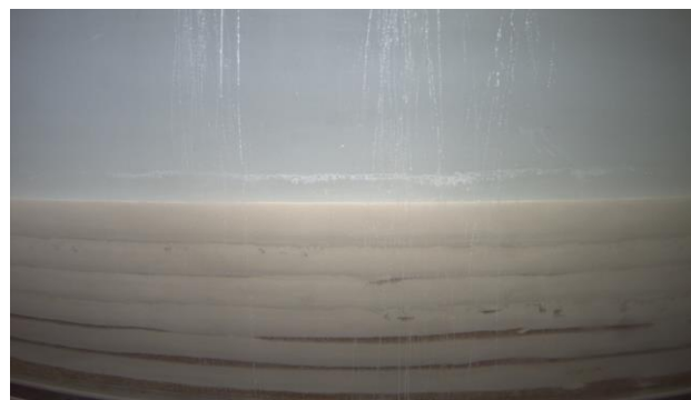
Figure 2. Photograph taken in-flight during the sedimentation procedure (Divall et al. , 2018)

vertical permeability tests. This eliminates potential issues of preferential drainage paths and overestimations of permeability associated with extracting falling head permeability samples. The sedimentation columns filled with slurry for sedimentation are shown in Figure 3. Four sedimentation columns can be used at the same time whilst ensuring they sit on the centreline of rotation.