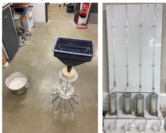
Figure 5. Hydro splitter used to sub-batch slurry and the vertical permeability set up.

Once the slurry was mixed it was passed through a hydro splitter (Figure 5, after Phillips, 2014). The hydro splitter divides the input slurry into identical sub batches, thus ensuring there was the same particle size distribution in each of the columns containing the same slurry. This was essential in obtaining consistent results as a differing particle size distribution would likely change the observed anisotropy. The distilled, de-aired water placed in the sedimentation columns to stop the porous stones from drying was poured away and the slurry poured in to a predetermined level. Within each centrifuge sedimentation test conducted the mass of soil within each of the sedimentation columns were kept consistent.