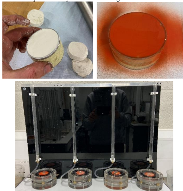
Figure 6. Prepared samples for horizontal permeability testing (top) and the horizontal permeameter setup (bottom).

The prepared samples and the set up used to determine the horizontal permeability are shown in Figure 6.