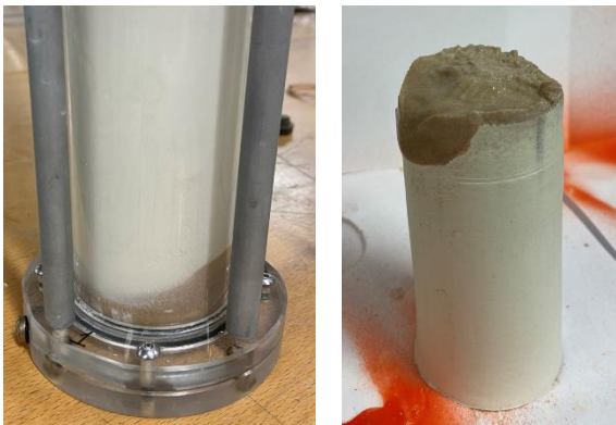
Figure 7. Sand slumping within the sedimentation columns and after extrusion

Using combinations of Speswhite and LBS E were not investigated any further primarily due to the fact this method creates two layers, a uniform sand layer overlaid by a uniform clay layer. A centrifuge model with these features can be created without the centrifuge as described in Grant (1998). This test did highlight the importance of sedimentation time and the resulting uneven layers.