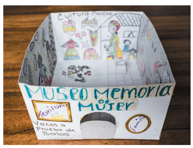
{\bf Fig.~2.} Co-created mini-museum created by one of the participants in the workshop.