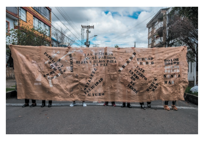
Fig. 6. Finalised jute material with slogans by participants in the workshop.