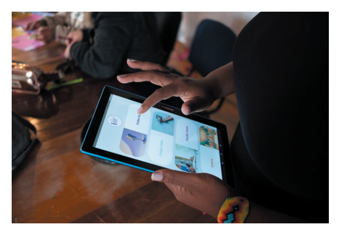
\begin{tabular}{ll} Fig. \ 7. \ The \ application, \ Mujeres \ Voces \ Invisibles \ del \ Conflicto \ (MVIC). \end{tabular}