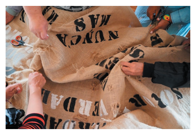
Fig. 5. Co-creation of jute material with slogans by participants in the workshop.