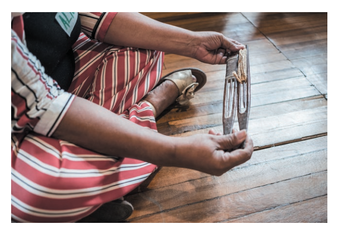
Fig. 3. Symbolic object brought by one of the participants in the workshop.