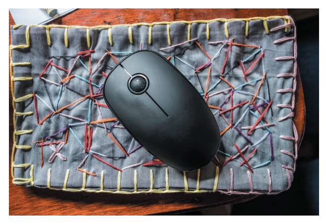
Fig. 4. Symbolic object brought by one of the participants in the workshop.

a Victim, Displacement and Lost Son; as well as videos documenting the process of the workshops with titles including Let Me Refresh Your Memory, Threading Memories, Listen to Us!, Their Place Within Memory, Our Bodies Were Left in Threads and A Museum for Me.