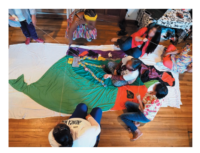
Fig. 1. Co-creation of a map of Colombia using material and threads.

This method of co-creation was a significant part of the process because it allowed the women to become more invested in the study; instead of being passive providers of information to be used by an artist, they took an active role in deciding how they wanted their stories