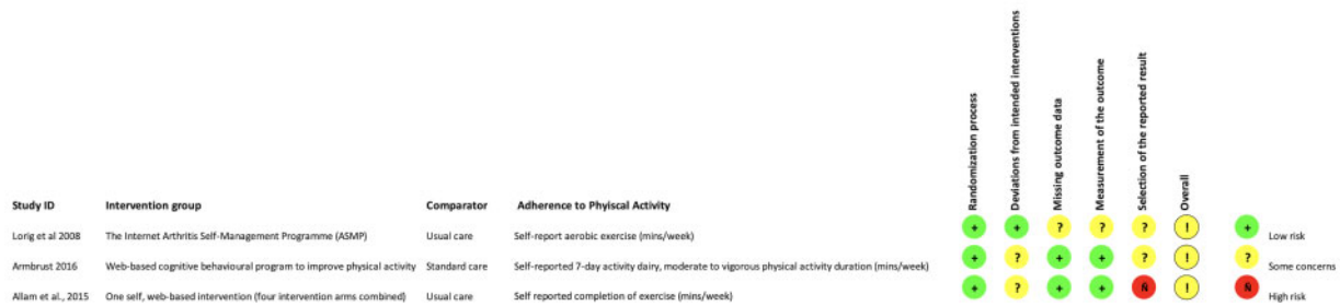
TABLE 2 ROBINS-I risk of bias for included cohort studies