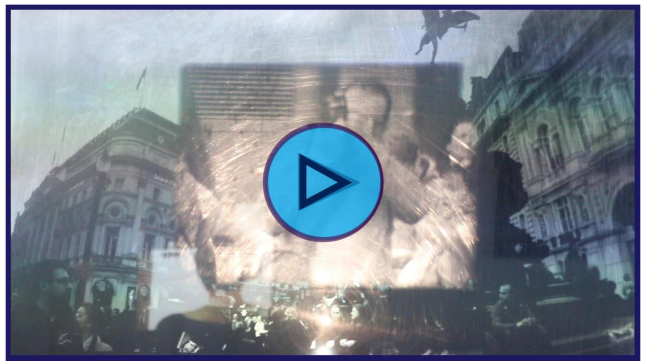
Figure 2: Video documentation, Alex Nevill, In Light of Moving Images , Centrespace Gallery, Bristol, 4–6 November 2017. Screenshot with link to video.