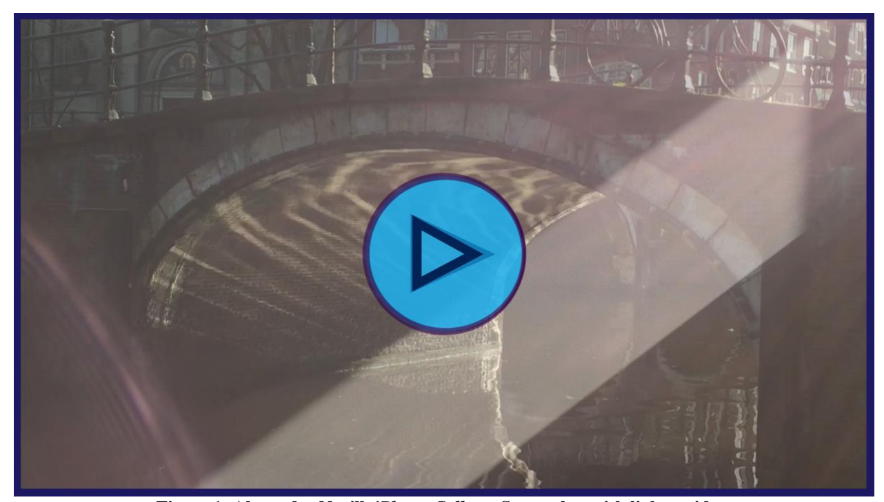
Figure 1: Alexander Nevill, iPhone Collage. Screenshot with link to video.

following a provocation from my supervisory team, I started filming an ad-hoc collection of moving imagery using my iPhone throughout daily activities which focused on rare or illustrative instances of ambient light.