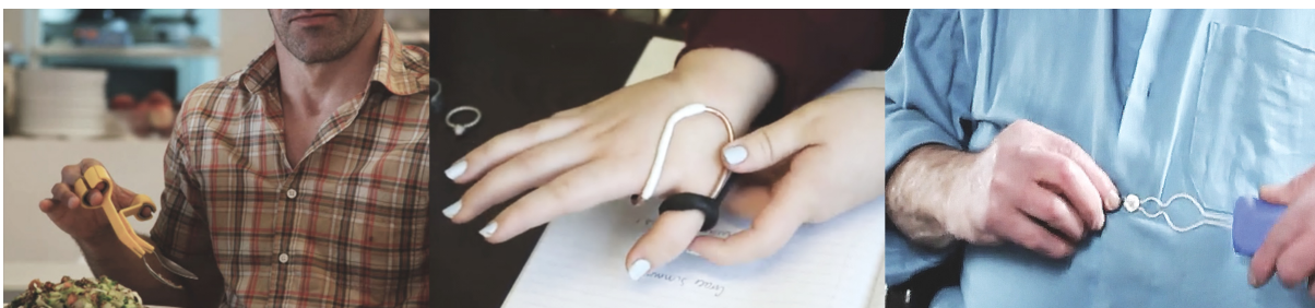
Figure 3. Examples of Fixperts outcomes (left to right): assistive feeding device, a button fastener for arthritis sufferer, and a thumb brace for a sufferer of Ehlers-Danlos Syndrome.

Typical Fixperts projects are either supporting or enabling devices, with the focus on making a positive impact in the daily life of the Fix Partner (usually someone with a disability or restrictive medical condition). Solutions tend to be a bespoke design, an innovation or an adaptation of an existing product to improve usability. The outcomes below are a selection of recent assistive designs.