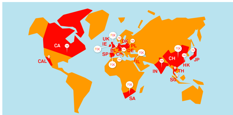
Figure 2: The global spread of Fixperts – location of participating universities

Since its launch in 2012, the Fixperts network has spread globally with universities in 18 countries now engaged with the Educational Project. The map below shows the global distribution of participants who have contributed more than 250 social innovation projects at the time of writing. This rapid growth is due to the enthusiasm with which design and engineering lecturers have embraced it as a learning tool for engaging students in social design. Whilst some universities such as Kingston and Brunel in London have participated in this initiative shortly after its inception, the network now engages students as far away as China, Poland, Africa, India Israel and Mexico.