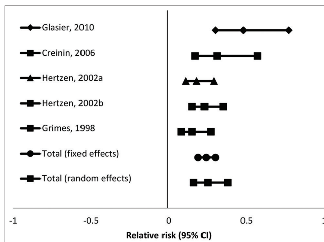
Figure 2: Forest plot of observed pregnancies using levonorgestrel versus expected pregnancies with no intervention

Where C1 = cost of CP service; C2 = cost of no intervention; P1 = probability of success; and P2 = probability of unsuccessful outcome