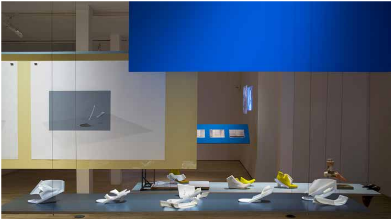
Figure 1. A Measurable Factor Sets the Conditions of its Operation. Exhibition shot.

With this definition in mind, and rejecting the standard, regimented approaches and limiting parameters of the shoe industry as described above, I started from scratch to rethink the method by which shoes are designed. Employing processes drawn from an engineering approach, I set out to design a collection of footwear pieces informed by research into the structural parameters required to support a foot, in a high-heeled position, while in motion. This method purposefully shirks the existing footwear configuration of assembled parts, fashion trends and styles –that which architect and design theorist Christopher Alexander might refer to as “the chosen formal order”. [1] Applying an engineering process to the design of footwear, I imagined, could allow me to create radically different shoe typologies. Congruently, such an approach would foreground the perception that high-heeled shoes are a piece of technology , and in so doing expose the gendering of different disciplines and objects.