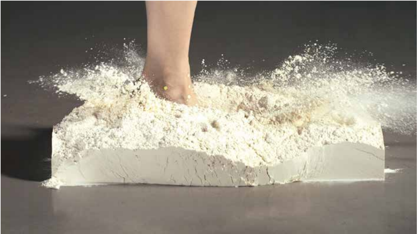
Figure 9 & 10 Material Compulsion Film Stills