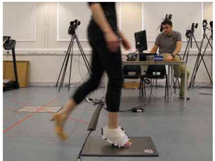
Figure 15 Pressure Mat Testing