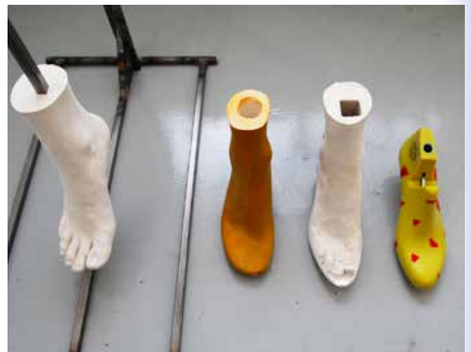
Figure 2, 3, 4 & 5. Custom Last Development.