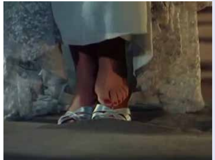
Figure 11, 12 & 14 Women in Various States