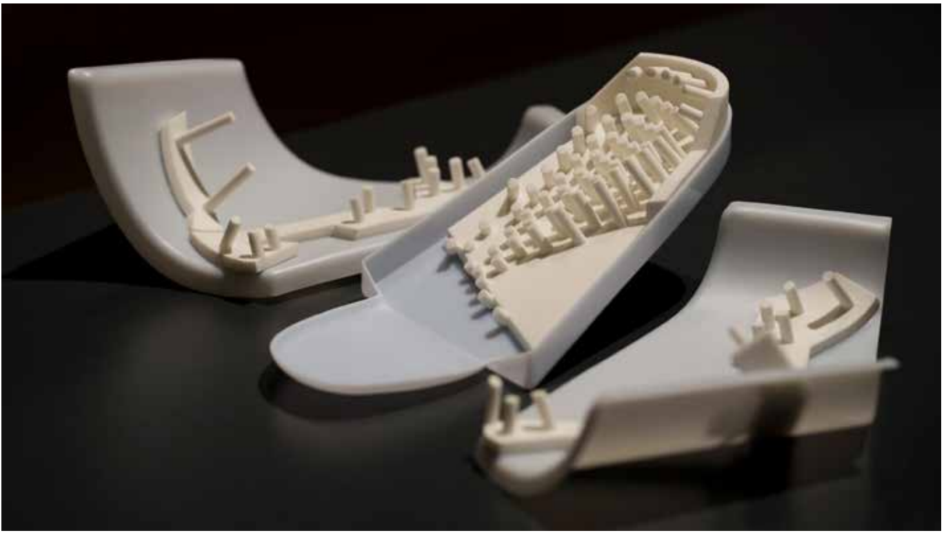
Figure 13 White Prototypes