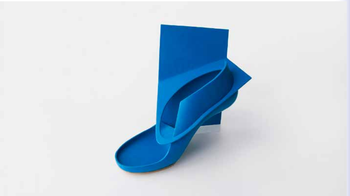
Figure 5 White Prototypes & Figure 6 Bluepanelshoe