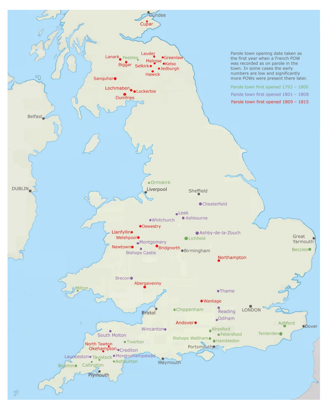
Map 2.1 - Periods when parole towns first opened

Sources: TNA: PRO ADM 103/549-56, 561, 563-8, 570, 580-5, 587-8, 590-2, 594-6, 598-9, 601-2, 604-14