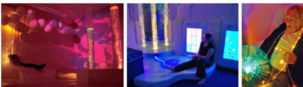
Figure 2: MSE examples: Snoezelen room for people with severe cognitive disabilities in De Hartenberg Centre, Netherlands (© A Verheul); Multisensory Room by ROMPA, one of the leading suppliers of MSE equipment (Source: online, last accessed 12/12/2013, http://www.rompa.com/multisensory-environments-rooms ); MSE for older people in The Mount Hospital Leeds (Source: online, last accessed 12/12/2013, http://www.communitycare.co.uk/blogs/mental-health/2010/02/multisensory-snoezelen-room-fo/ )

The MSE concept originated in 1966, when American psychologists Cleland and Clark set up several Sensory Rooms they referred to collectively as a 'Sensory Cafeteria' (Cleland, Clark, 1966). Following on from this the first 'Snoezelen' (the term derived from the two Dutch words 'snuffelen' and 'soezen' - the equivalents for English 'sniffing' and 'dozing') was subsequently developed by Dutch therapists Jan Hulsegge and Ad Verheul in the 1970s for adults with severe learning disabilities (Hulsegge, Verheul, 1987). The MSE concept has since been adopted worldwide coming to the UK approximately 30 years ago where it was embraced as a leisure driven activity with a focus on enablement (Hulsegge, Verheul, 1987).