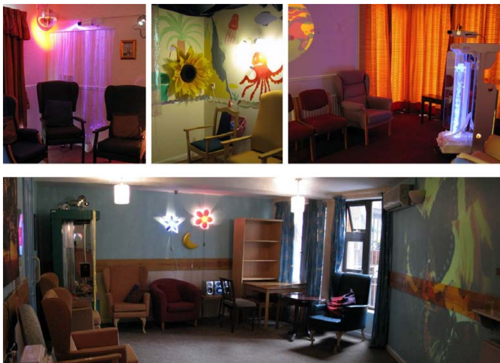
Figure 3: Existing MSE facilities / Sensory Rooms in some of the care homes visited

experience. The furniture did not offer an alternative seating position; the vestibular sense was neglected completely.