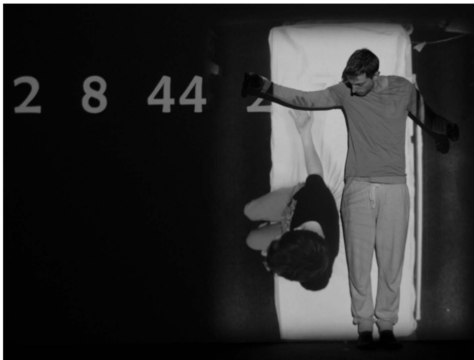
Figure 1 Bloodlines performance photo by Anna Tanczos.

by the team after the performance had been devised to explore its impact on audiences. The research uses a mixed method design comprising two elements: a short questionnaire distributed to and completed by audience members immediately after the performance, and a series of in-depth semistructured interviews with select audience members that took place at least a week after the performance.