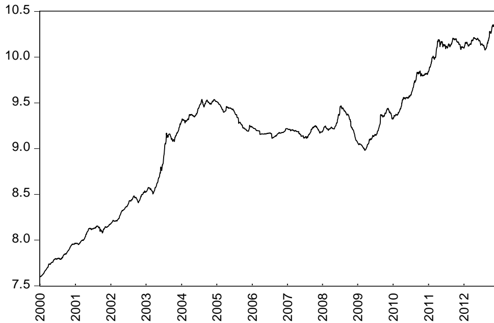
Figure 1. Tehran market index (natural logarithms)

Figure 1 shows, in logarithms, the Tehran Stock Exchange (TSE) all-share price index (TEPIX) over the period 2/January/2000 – 31/December/2012. The possibility of structural breaks in the trend is evident – whether this trend is deterministic or resulting from a random walk with drift. The following brief history points to a number of institutional and environmental developments that may have induced such breaks.