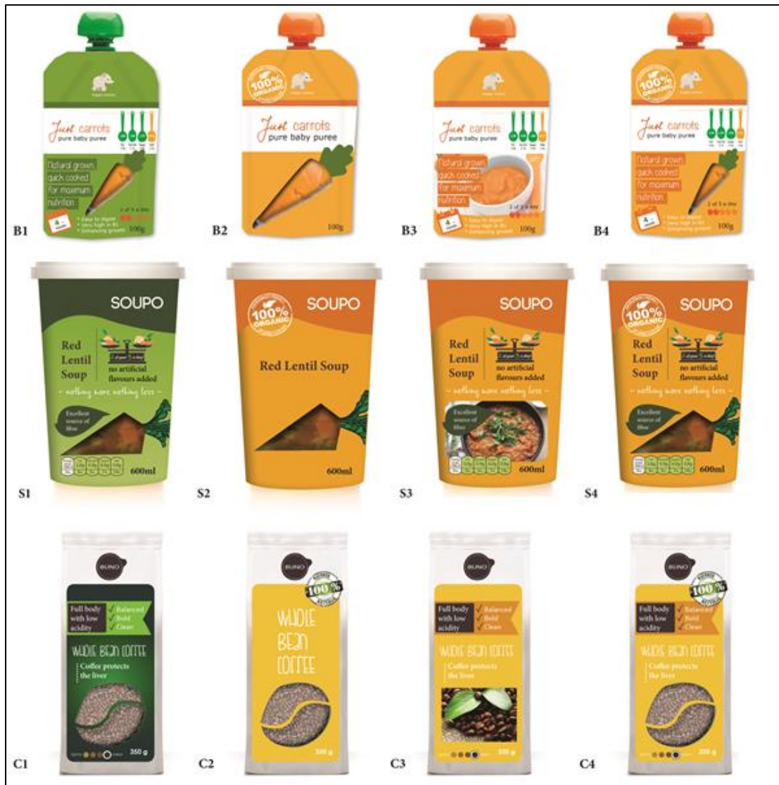
Figure 1: Examples of attribute levels for Baby food (B1-B4), Soup (S1-S4) and Coffee (C1-C4)