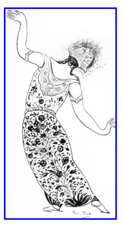
Fig. 3. Programme Illustration: back of the Péri's costume. René Piot, design for La Péri , Programme, Concert de danse N. Trouhanova . Private Collection.

Iskender's costume is described by Piot as a 'long Persian robe made from satin, gold buttons, raised gold paints, on which will be applied a crimson velvet carved with the grand arabesque of embellishments. A belt and sleeves of gold. He is groomed in a grand turban of ivory velvet.'109 Iskender's colour palette alludes to opulence. The densely patterned robe consists of vines (Figure 4). Like the Péri, he wears a belt, upon which he carries a dagger. Iskender's costume is darker and denser than that of the Péri. He is the hunter who is armed, wearing a decorated outfit that may be seen to correspond to the rhythmic urgency of his theme and to his quest for the immortal flower. Iskender's theme is constructed from a sustained tonal chord punctuated by mildly dissonant chords in double dotted rhythms, followed by ascending quavers (first presented at bar 16, Example 2): the sharp rhythmic and melodic contours correspond on a basic level to Iskender's more angular costume. It is also worth noting at this stage that the hunting nature of his expedition (from a Western perspective) is mirrored within Dukas's orchestration with frequent use of brass (especially horns) for his fanfare-style theme. This rhythmic interjection and brass associated melody contributes toward his importunate character.