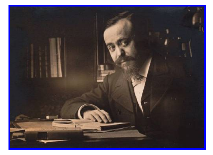
Fig. 1. Paul Dukas.

manuscript, Dukas crosses out his original direction in a curving line (above bars 111-13: 'Sans rigueur. Le mouv<sup>t</sup> s'anime légèrement presque dès le début') and replaces it with a more focused direction: 'Au début: un peu plus animé en avançant.' This is the most extensive change to be found in the manuscript: it is also a point to which Dukas returns in a letter to the conductor Joseph Guy-Ropartz.<sup>21</sup> This section, with its label 'danse' in a dance-based work, holds meaning and significance for Dukas's interpretation of La Péri .<sup>22</sup> Bearing in mind the attainment of artistic synchronisation for which Dukas aims, it is perhaps to be expected that the other dance-centred collaborators will grasp the dramatic importance of this music, and adjust their own contributions accordingly.