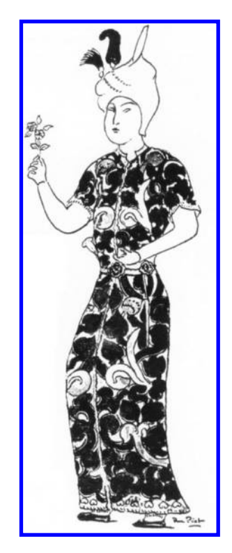
Fig. 4. Programme Illustration: Iskender's costume. René Piot, design for La Péri , Programme, Concert de danse N. Trouhanova . Private Collection.