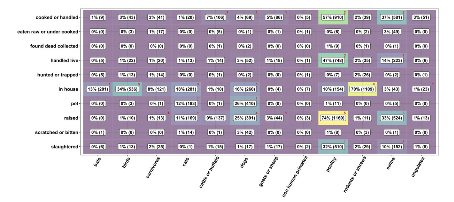
Figure 1. Animal contact by taxa and activities. Values and shading represent the survey population; red numbers in the upper-right corners of the cells indicate the number of seropositive individuals with the given contact.