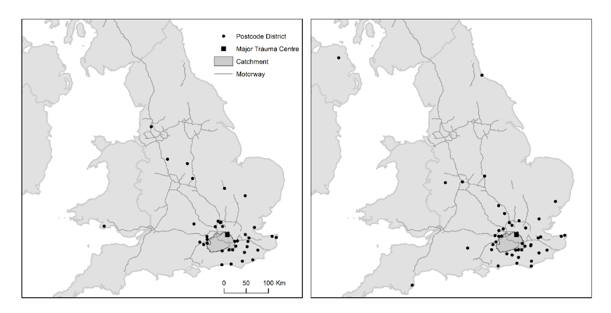
Figure 2. Survey addressees' location of residence. Indicated are United Kingdom postcode districts of responders (n=47) and non-responders (n=56). Some postcode districts include multiple addressees (data not shown).