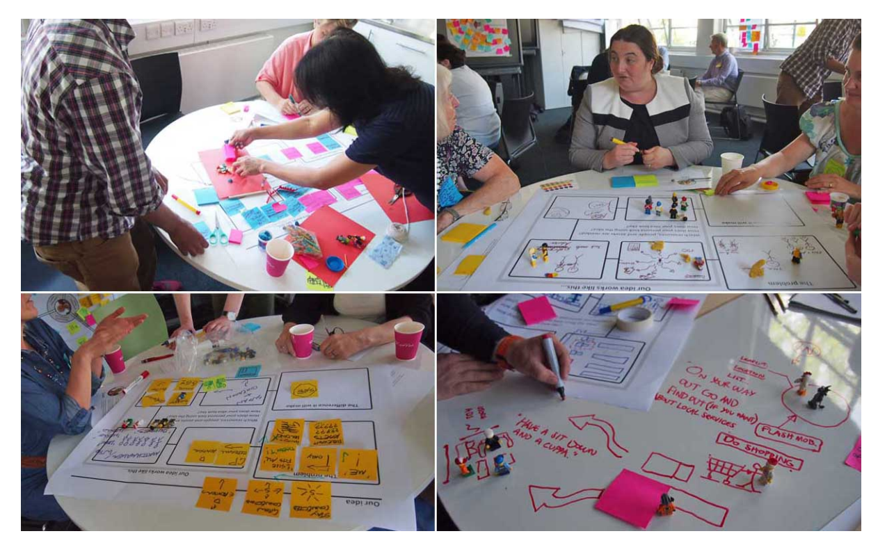
Figure 6 Teams working on their service prototypes in order to explain how their idea would work and the impact of this idea in the persona's life and eventually throughout the community.

In terms of the co-design process, the event showed the importance of ensuring a group dynamic in which different voices would have a hearing, drawing on widely different areas of knowledge and experience.