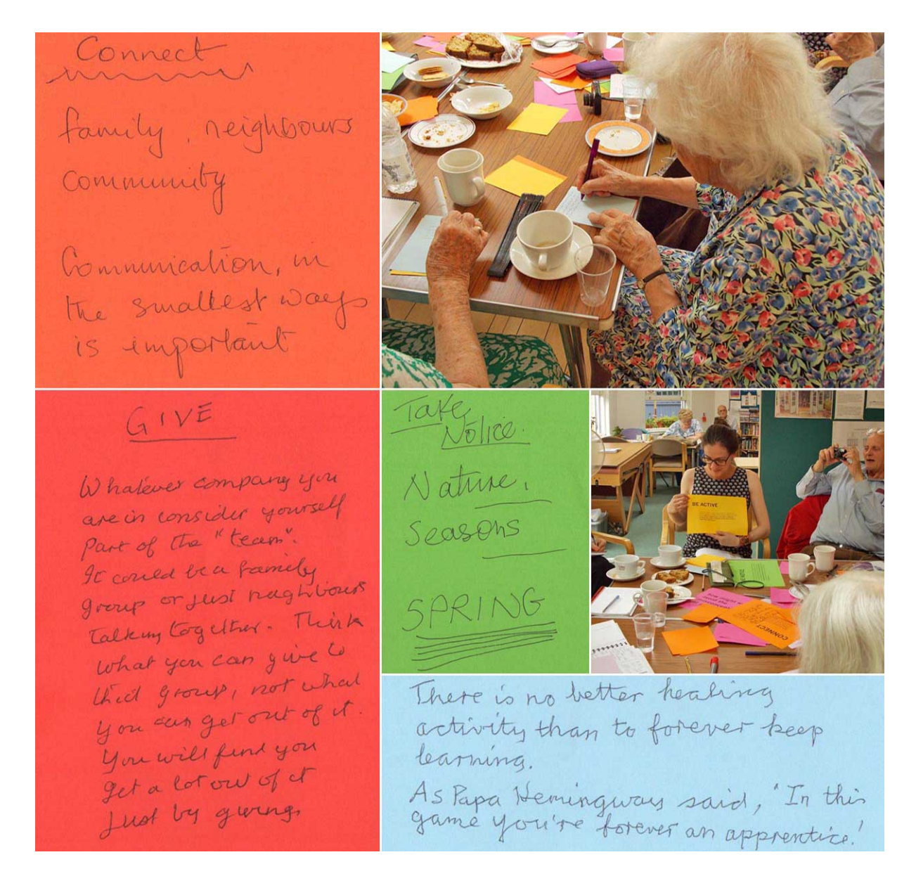
Figure 2 Outputs of the reflection and discussion based on the report "Five Ways to wellbeing" of The New Economics Foundation, which was used a catalyst to stimulate naturally the conversation about this agenda as respects the elderly.

This social interaction fostered closer links with some service users, who became potential participants in the second workshop. Furthermore this was a discovery process in which the ageing agenda was not understood through a dry list of requirements established in a design brief. Instead a variety of interviews, together with ethnographic observations made during their daily activities and a group discussion table, enabled a dialogic interaction, aimed at strengthening a bond of empathy, and providing insight into their challenges, needs, and aspirations.