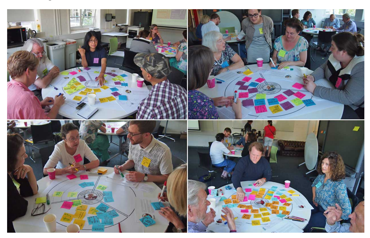
Figure 5 Teams during the discussion and analysis of the given agendas. This process was guided by understanding the persona's challenges and interactions, and finally by recognition of the available local assets which would provide significant support to the persona.

An initial question sought to stimulate lively and energetic subsequent discussion, while suggesting potential areas which it might be fruitful to consider, and which were likely to call forth a range of different ideas.