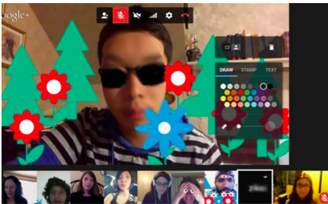
Figure 3. Example of playful community building during one group Hangout.

Moreover, many students mentioned in their feedback that they enjoyed meeting others from different countries; for example: “It was very interesting to find out new things about other countries. I also realized things about my country that I didn’t know before.” (C2R10). Other evidence of the strength of bonds formed was the fact that students were not only meeting in real life when they travelled to other countries, but they also shared these news in photo updates with the rest of the communities.