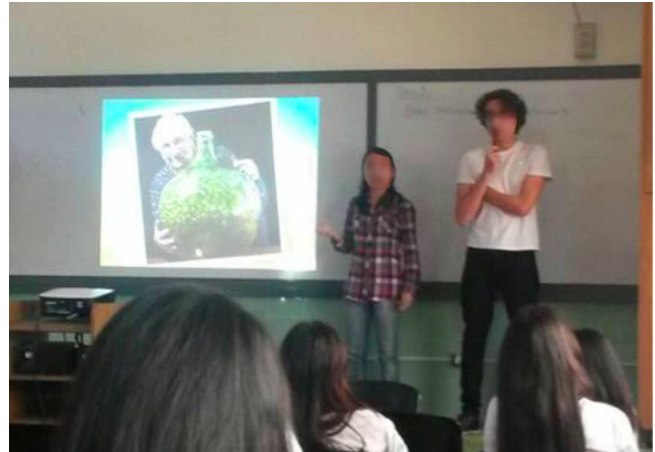
Figure 2. Online UWC students present what they learned in the course at their school

positively mentioned they already had been involved in volunteering projects when they started the course.