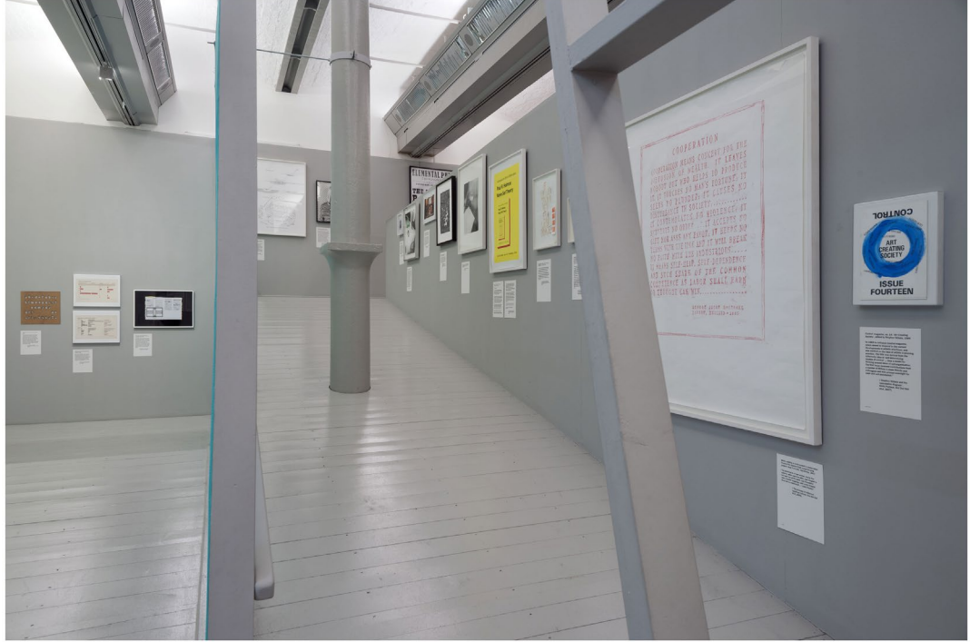
Figure 3(a, b) The Serving Library installed at Tate Liverpool within, La Colline de l'Art (Art Hill) by Claude Parent. 2014–15