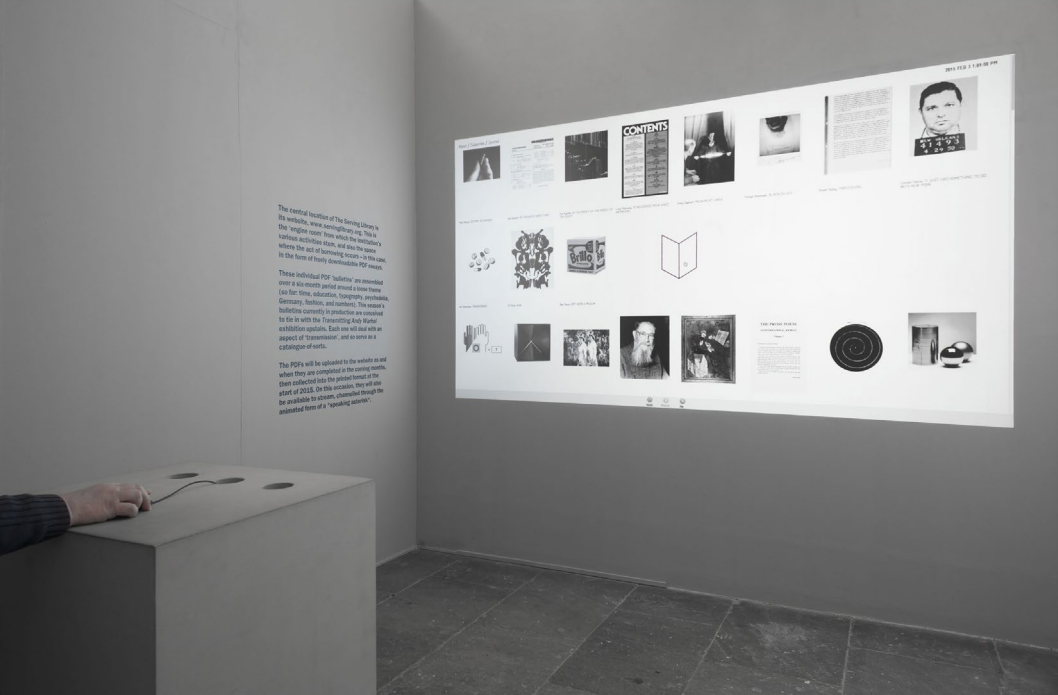
Figure 1. (continued)

installation, they had organized a joint symposium event with the University of Liverpool's Centre for Architecture and the Visual Arts (CAVA).<sup>27</sup> Here, the disruption of categories and order systems and the "convergence of abstract propositions and physical reality in architecture