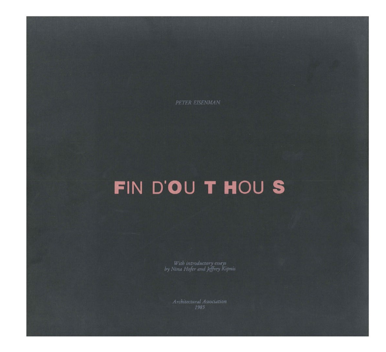
Figure 2 Outer box cover of Peter Eisenman's Fin d'ou t hous (1985).

Architecture as a sign system is ambiguous, as Umberto Eco pointed out, and in order to be understood its message has to be supplemented by other signs. Indeed, as semiotics (the theory of signs) began to show in the 1960s, all media of communication are subservient to words. Architecture stays in one place, while