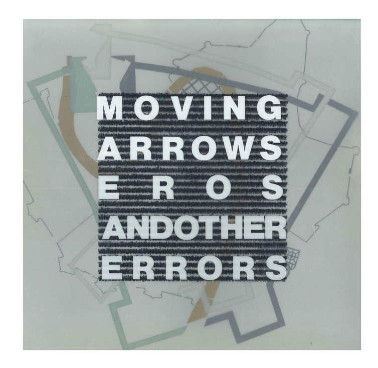
Figure 3 Front cover of Peter Eisenman's Moving Arrow Eros andother Errors (1986). The image is of the first twelve pages; the pages are printed on transparent acetate and so all are visible at once. Pages four to nine are text, which provides the black background to the title, which is spread over the first three pages.

Architecture as a sign system is ambiguous, as Umberto Eco pointed out, and in order to be understood its message has to be supplemented by other signs. Indeed, as semiotics (the theory of signs) began to show in the 1960s, all media of communication are subservient to words. Architecture stays in one place, while