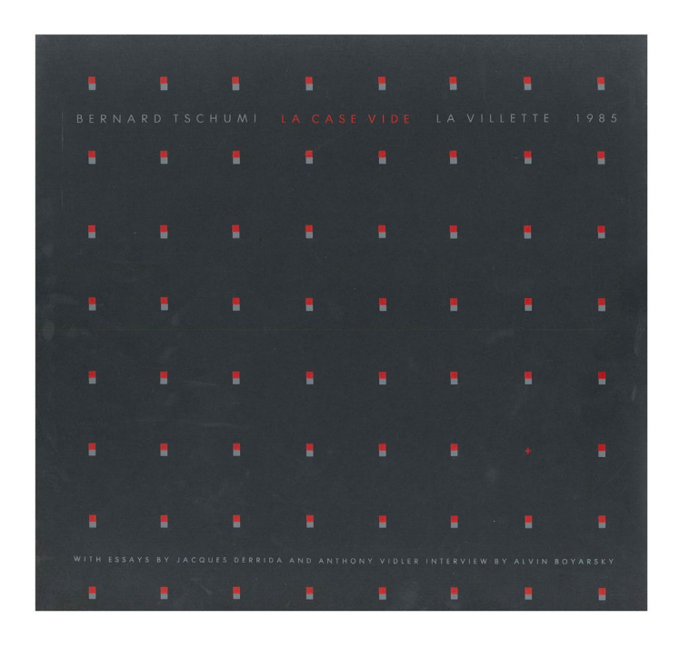
Figure 1 Outer box cover of Bernard Tschumi's La Case Vide (1985). © Architectural Association Publications, Architectural Association School.

Charles Jencks' chapter follows Powers' and is equally sure of the status of architecture: