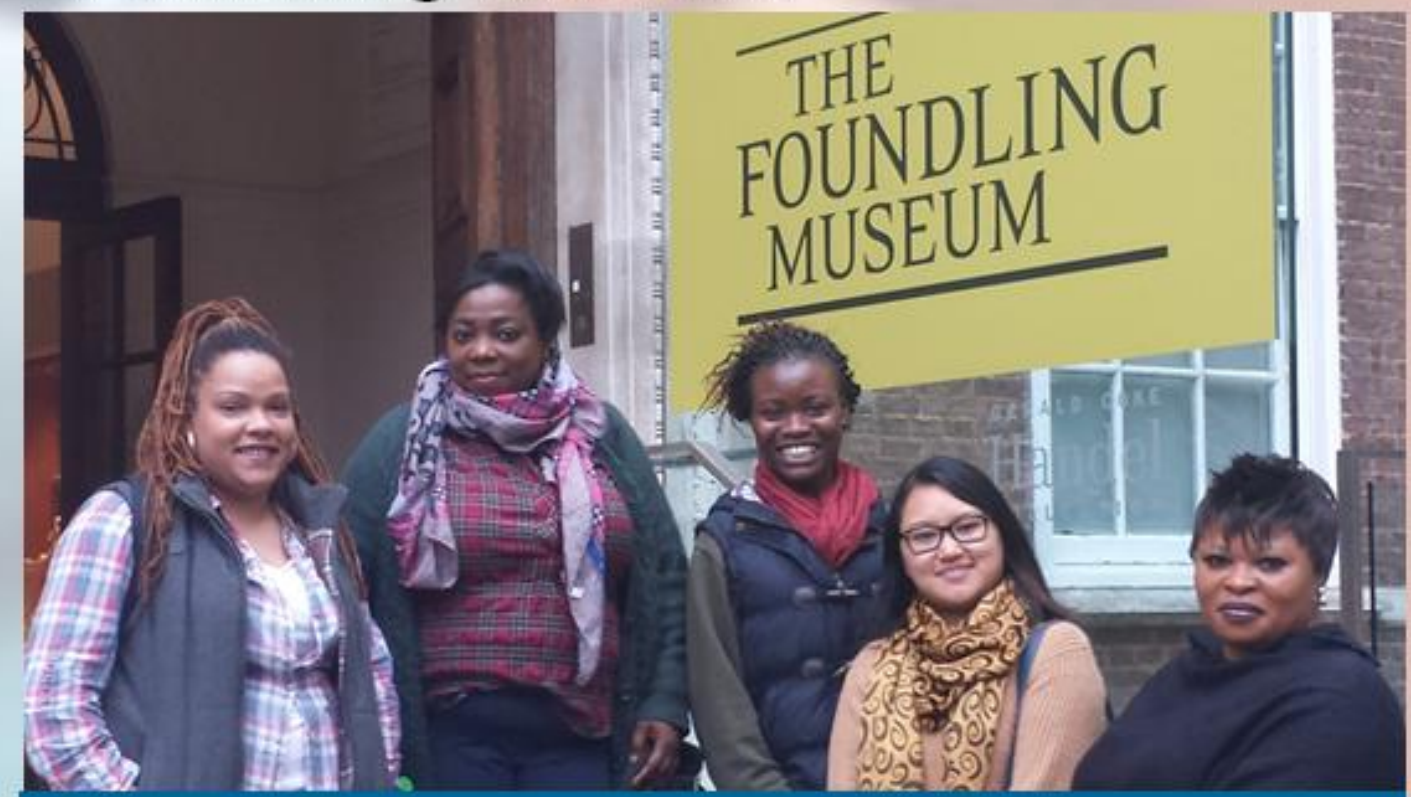
Kingston University London