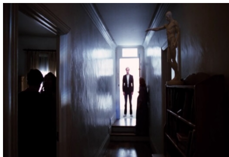
Figure 7: Altered States