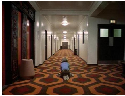
Figure 11: The Shining

whose cinematic spaces are altered spaces (states) that push against the contours of the frame itself, seemingly expanding it outwards.