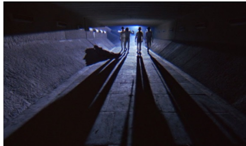
Figure 5: A Clockwork Orange