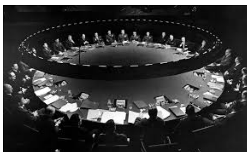
Figure 2: Dr. Strangelove