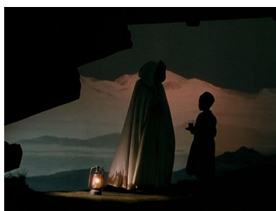
Figure 3: Black Narcissus

Portals and thresholds also play a pivotal role in the work of both Russell and Kubrick (as we will later discuss in Section 4). Across their bodies of work there are revealing instances of characters' crossing thresholds that are 'alternate', 'threatening' and 'unreal'. In A Clockwork Orange , the underpass where Alex and his droogs beat up an old tramp, and in Russell's Altered States (1980) Jessup's (William Hurt) journey into the cave in order to begin a hallucinogenic journey. Again, both directors exhibit a visual style anticipated in the work of Powell and Pressburger. In Figures 5, 6 and 7 we may observe across the three a cross fertilisation of imagery in the representation of the threshold to an 'Altered Space' or state.