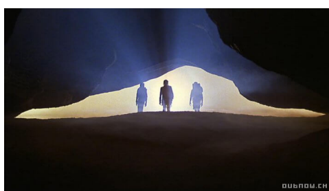
Figure 4: Altered States

Powell and Pressburger's films offer a deliberate sense of artifice, theatricality and monumental mise-en-scène that is also present in Kubrick's and Russell's, and in which (as with the earlier use of jump cut) separate hermetic worlds or spaces are bridged together. This is exemplified by the staircase, complete with classical sculptures, in A Matter of Life and Death , which bridges this world to the afterlife. This image anticipates the receding perspective of the frame common to both Russell and Kubrick. Here the image is echoed in Altered States (a film which deals with travelling between different states of consciousness and in which corridors receding into the back of the frame are a recurrent visual motif).