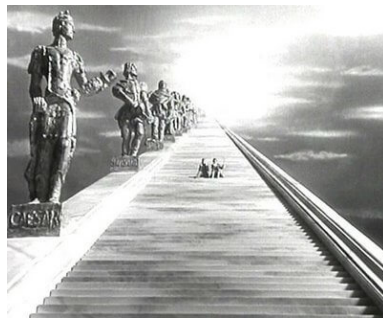
Figure 6: A Matter Of Life and Death