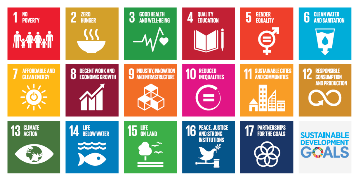
Fig 1. The Sustainable Development Goals (SDGs).

Building on the Millennium Development Goals set in 2000, 17 SDGs were formally adopted by all 193 member states of the UN in September 2015, aiming at ending extreme poverty, protecting the planet and ensuring prosperity for all by 2030 (UN, 2015). The SDGs expanded the agenda to include issues such as climate change, sustainable consumption, innovation and the importance of peace and justice, requiring all countries to take action, including those with high levels of development.