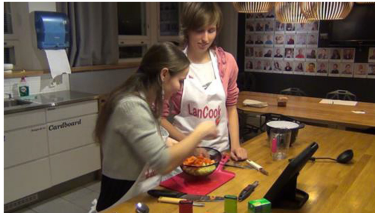
Fig. 5 'sekoittaa?'

The solution, however, is short-lived. In line 8, L2 appears to re-initiate the repair in a partial turn and in line 9, the kitchen indicates that help is available. The prompt demonstrates a 5th repair initiation sequence where help availability is activated by the kitchen as the system has detected non-activity on the relevant object assigned to that step (the tap). Both L1 and L2 orient to the prompt as an 'other repair initiation' linked to their ongoing activity (and therefore indirectly to their linguistic understanding of the action 'huuhtele'), then L2 accepts the initiation of repair by activating (shaking) the help tool. The availability prompt from the kitchen is designed to be only a partial initiation of repair, offering a choice over the initiation of a full repair. In this case, the learners choose the full repair initiation, leading to the activation of Help 1: Table 7.