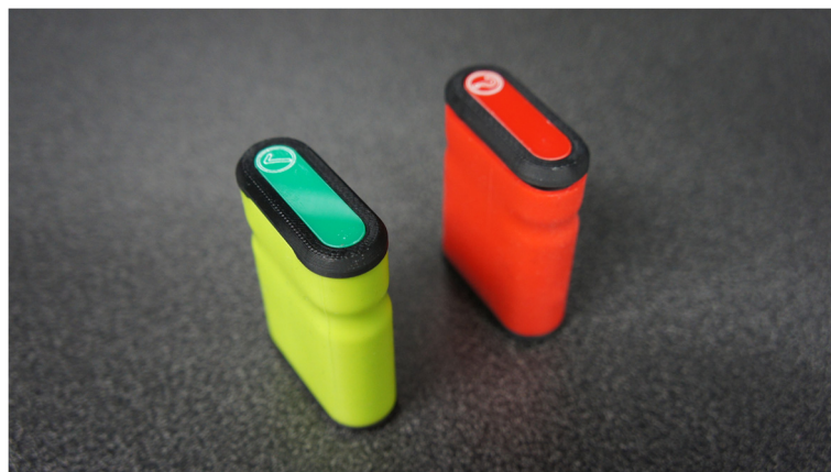
Fig. 2 Red and green interaction tools

For the learner, these supports were designed to help them understand the kitchen's instructions and therefore what they needed to do next to complete the cooking task. It