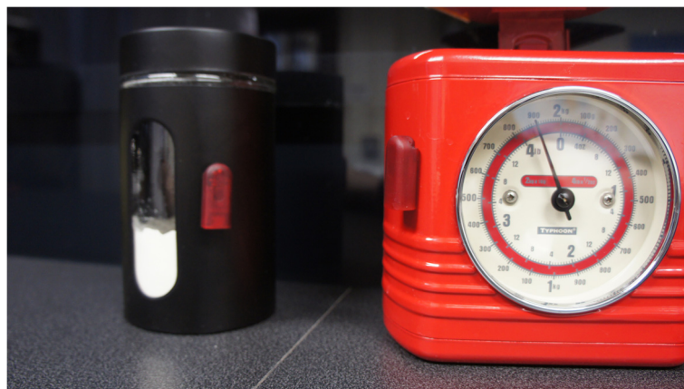
Fig. 1 Augmenting a learning environment for language learning and cooking

The EK grew out of three previously published kitchens (the Ambient Kitchen, Olivier et al. 2009; the Assistive Kitchen, Kranz et al. 2007 and the French Kitchen. Hooper et al.