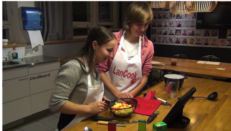
Fig. 6 Help 2

there needs to be closer focus on the relationship between learning theory, context-aware technology as well as what happens in the ‘interaction space’ when these systems are used. There should be more balance between technologically-driven practice and theory driven research approaches.