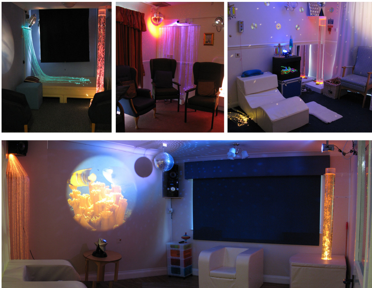
Figure 1: Examples of Sensory Rooms with MSE equipment provided by suppliers: bubble column, disco ball, projector with themed image-wheel, coloured optic-fibres, CD player/sound system, waterbed and furniture with liquid resistant vinyl covering.

According to information given during interviews, frequency of use varied greatly ranging from daily to weekly or less. Most staff confirmed that their facility could be used more often if there was more time to take residents there and/or if residents would/could go to the room by themselves. In most cases the room was locked when not in use because staff thought it was not safe for either the residents and for the expensive equipment (see Figure 1). In most homes, residents were accompanied by the activity coordinator. Relatives were not involved in using the Sensory Room.