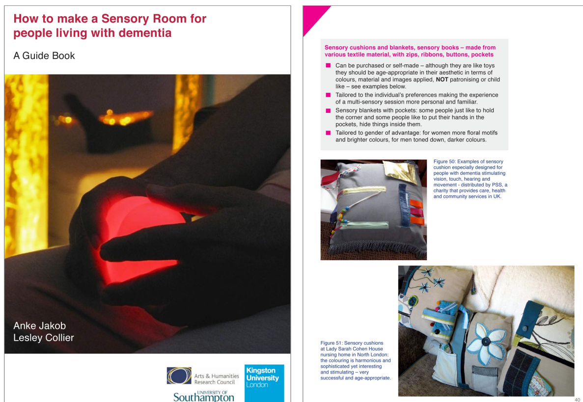
Figure 3: Pages from the Guide Book

Three undergraduate graphic design students from Kingston University were invited to collaborate on developing the design of the guide book. Requirements here were: clear and accessible, easy to navigate and well structured, yet inspiring and refreshing. This was achieved by applying colour coding for each heading making navigation easier and emphasising each theme, using a lot of images and limiting the text and written information, employing clear graphics and signs.