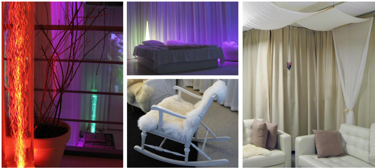
Figure 2: Sensory Rooms in Kontula, Riistavouri and Roihuvuori Centre, Helsinki, Finland

Based on the research results and the input from the visits and the meetings with the project's Advisory Panel of Experts, a design brief was developed defining design principles taking into account lighting, climate, accessibility, use of technology, health & safety/maintenance, maintaining dignity, familiarity etc. Following points emerged from this process as the most important criteria to be considered when designing a successful and effective multisensory space for people with dementia: