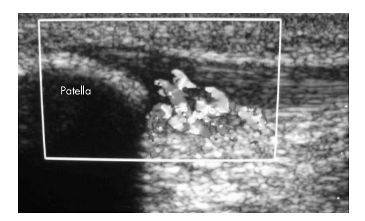
Figure 1 Longitudinal image of the proximal patellar tendon. Colour Doppler shows marked neovascularity in the hypoechoic segment of the proximal patellar tendon.

Mountain View, California, USA) with a 15L8W transducer and a Toshiba 5500.